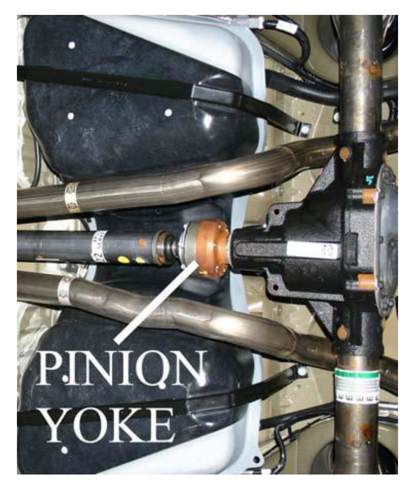
This product is an aftermarket accessory and not designed by the vehicles manufacturer for use on this vehicle. As such, Buyer assumes all risk of any injury caused to the vehicle/person during installation or use of this product.

• Once pinion angle has been set, apply Loctite to jam nuts and tighten.